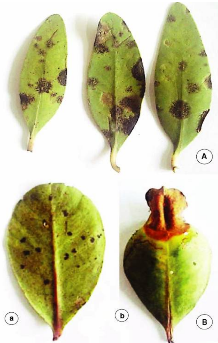
Fig. 1. A. Black leaf spot of Sonneratia apetala . B. leaf spot (a) and anthracnose (b) of S. caseolaris .