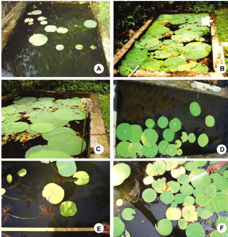
Figs. 1A-F: A-C. Growing stage of seedlings of Nelumbo nucifera in the deep water culture pit with large leaves, flowering and fruiting stage. D-F. Plant grown in shallow water culture pit of Nelumbo nucifera with small leaves and no flowering and fruiting stage.

observed during the monsoon ( 18.31 \pm 0.98 \text{ cm}^2/\text{day} ). In winter the growth rate was 1.71 \pm 0.55 \text{ cm}^2/\text{day} whereas autumn showed poor growth of the plant ( 2.33 \pm 0.29 \text{ cm}^2/\text{day} ; Fig. 2). Another aquatic macrophyte Euryale ferox also showed increased growth rate of leaf area in summer (6) . Petiole length showed highest growth rate of 0.34 \pm 0.10 \text{ cm/day} in monsoon. The summer season showed a medium growth in the length of the petiole ( 0.29 \pm 0.05 \text{ cm/day} ). In autumn, the petiole length grew at a rate of 0.25 \pm 0.07 \text{ cm/day} . Least growth rate of the petiole was observed in winter ( 0.22 \pm 0.05 \text{ cm/day} ; Fig. 2). Similar type of observation was also recorded in E. ferox (6) .