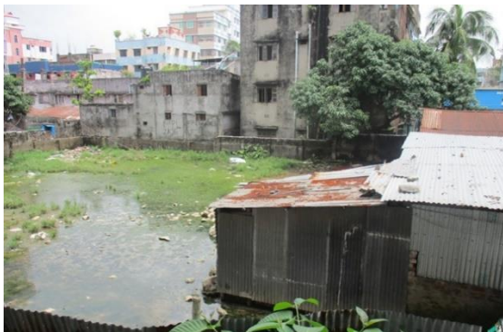
Figure 2: Densely Built Peri-urban Areas of Dhaka Experience Regular and Prolonged Waterlogging.

The selection of student respondents for individual interviews from different schools was made based on the age of students. Students below 10 years of age were not considered for interviews. For the primary school, student of grades 4 and 5 were considered for interviews. In case of the FGD group selection from the primary school, at least one of guardians of grade 5 students was ensured. In addition to the primary data collected from the schools, a number of institutions (Save the Children, Ministry of Education, Ministry of Primary and Mass Education, etc.) and relevant reports have been consulted.