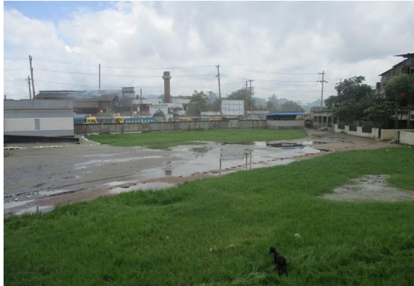
Figure 3: Waterlogging in a Case study school's compound

students are reluctant to attend classes; there is always the risk of accidents in waterlogged places. Teachers are required to run classes despite the waterlogging situation. They still remember the past flooding events and sufferings. In the 2004 flood, some schools were closed for 15-20 days. A water purification system is not available, and it becomes unhealthy staying in the damp classrooms. Most of the teachers also mentioned that they pay for rickshaws to transport them to work during waterlogged conditions.