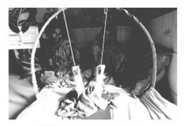
Figure 2: Bryant's skin traction.