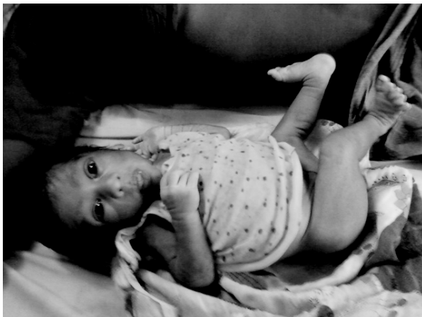
Figure -5: Baby in the third postoperative day

The uterus, left ovary and fallopian tube were healthy. Right ovary and tubes were attached to the placenta and distorted. A drain tube was kept in the peritoneal cavity and the abdomen was closed in layers. The patient had smooth recovery. Patient was given three units of blood transfusion. Post-operative period was uneventful and stitches were removed on the seventh post operative day (POD). Patient was discharged on 8th POD. The baby was advised to consult with an orthopedics consultants for reverse talipes equino varus of right ankle joint.