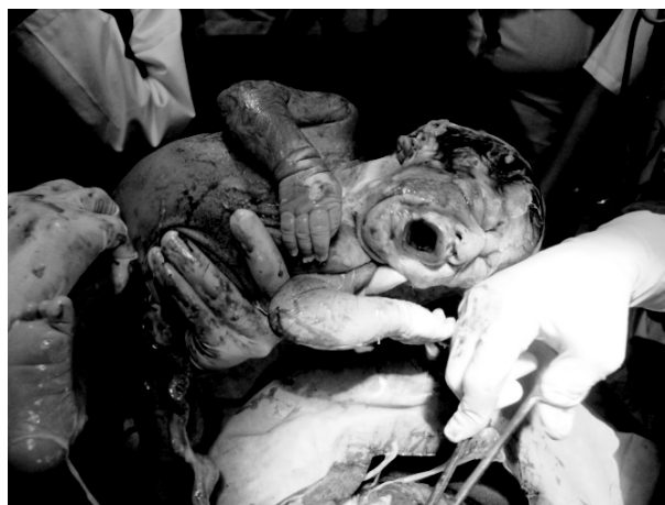
Figure - 2: Baby crying just after delivery