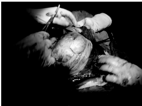
Figure -3: Placenta was attached to the omentum and gut