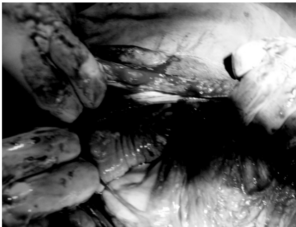
Figure -1: Baby delivered by laparotomy

On the next day, 3 units of blood were arranged prior to operation and laparotomy was done under general anaesthesia. The abdomen was opened by lower right paramedian incision carefully to avoid incision in to placenta. The membranes were not identified and there was no haemoperitoneum.