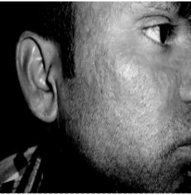
Figure 2. Before and after treatment of Seborrheic dermatitis with itraconazole.