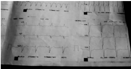
Fig - ECG