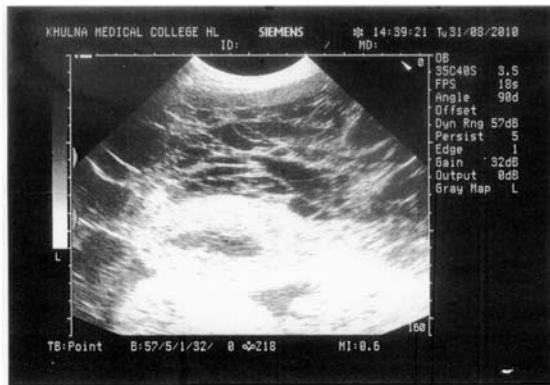
Fig-II: USG of abdomen showing appendicular growth with loculated immobile ascities.

thick gelatinous material. Study of this material showed sugar 3.5 mmol/L, Protein 5.1 gm/dl and no malignant cell was found. Ultrasonogram guided FNAC of the mass in the abdomen revealed mucin secreting malignant cells and the comment was mucinous adenocarcinoma (Fig-III)