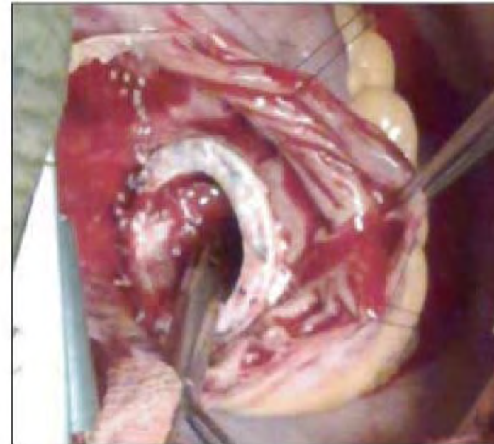
Fig. 3: The valve was seated.

After proper sizing, we put the 29 sized mitral bioprosthetic valve. From the surgeons view, the valve posts lied at the 12, 4 and 8 o'clock positions. The valve was seated and the sutures were secured starting at the septal leaflet (Fig. 3). The atriotomy was closed with 5-0 polypropylene sutures in one layer after de-airing maneuvers. The caval tapes were released and the patient was weaned from cardiopulmonary bypass. It is our practice to place epicardial pacing wires on all patients receiving a tricuspid valve replacement. Temporary epicardial pacing wires were placed in all patients given the higher incidence of transient conduction disturbances in the post-operative period following tricuspid procedures.