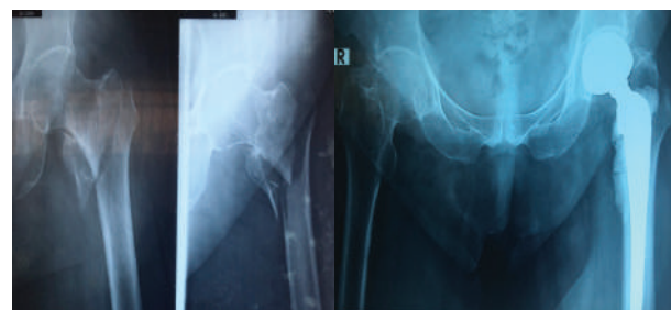
Fig 3: Pre & Post-Operative X-ray of left-sided Trochanteric Fracture of Femur