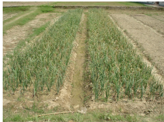
Fig. 3. Onion field seeded by the seeder, Gazipur

Before putting the seeds inside the drum, seeds were soaked for 24 hours for sprouting. Then small amount of seeds (100 g) were put inside the drum in each chamber. Seeding operation was started from a corner of the land. After placement the seeder in a corner, the seeder was pulled forward. When the seeder moved forward, wheel as well as the drum rotated and seeds dropped in the furrows made by furrow openers. Then the seeds were covered by drug chain and leveled the land.