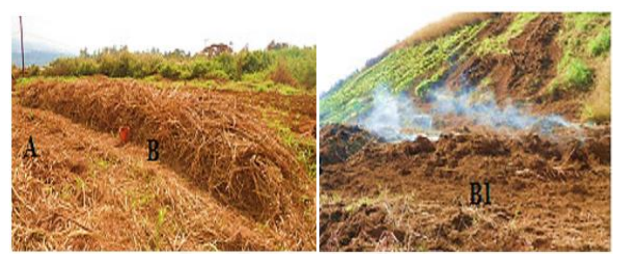
Fig. 2. The process of Ankara in smallholder farms in the North West Region of Cameroon.

Burning in ridges popularly called "Ankara" is the second most practiced traditional tillage practice in the North West Region of Cameroon. "Ankara" comprises the underneath burning of grasses arranged in ridges and covered with soil (Kometa and Kang, 2017; Robiglio et al., 2010). The process of Ankara making begins with the cutting down of shrubs and grasses which are allowed to fully dry. Subsequently, the dried grasses and shrubs are gathered in to piles or heaps and arranged in to ridges. Soil is then lifted by the small-holder farmer using a hand hoe and placed on the ridges formed from dried shrubs and fire is set beneath it (Bongajum and Suinyuy, 2015). This is usually done during the dry season for a few weeks to the commencement of rainfall, after which the Ankara ridges are planted when it begins to rain. The process of Ankara tillage in the North West Region of Cameroon is illustrated in Fig 2.