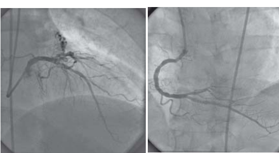
Fig-3. Left circumflex artery Fig-4. The right coronary was non-dominant and represent by the principal OM, that has a 80% discrete disease. concentric lesion in the proximal part.

Most coronary artery anomalies are clinically silent and do not affect the quality of life or life span of the affected individuals. These are usually discovered incidentally during non invasive or invasive diagnostic testing for unrelated symptoms. Large coronary artery fistulas may be associated with sudden death, myocardial ischemia, bacterial endocarditis or congestive heart failure. The exact incidence of these clinical events is not known. In large fistulas, sudden death has been attributed due to impairment of diastolic coronary artery flow. Large fistulas may reduce myocardial perfusion and thus cause ischemia. Large coronary artery fistulas may result in right or left sided cardiac volume overload with or without symptoms of congestive heart failure. The haemodynamic effects of coronary artery fistulas depend on their site of drainage, diameter and length.