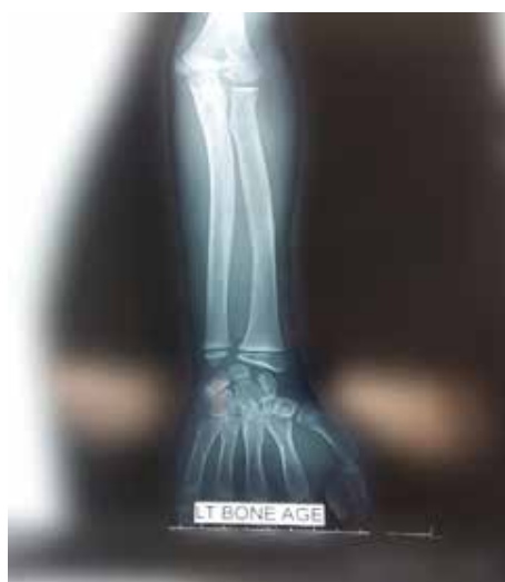
Figure 2: X-ray of left wrist and elbow showing advanced bone age in the 4-year-old boy

surroundings. His surgery and recovery period was uneventful. The histopathology study showed an encapsulated tumor composed of sheets of cells having pleomorphic nuclei with abundant clear to eosinophilic cytoplasm, mitoses were infrequent and no necrosis was seen (Figure-4). Immunohistochemistry showed tumor cells were positive for synaptophysin and inhibin A and negative for chromogranin A and GATA 3. Ki67 index was about 3% and it was confirmed to be an adrenal adenoma. Postoperative follow-up showed his testosterone and DHEAS levels were in the prepubertal range and his cortisol level was normal (Table-I). Subsequent follow-up after 6 months showed that his height was 126 cm, stretched penile length 15 cm, and testicular volume 5 ml on both sides. GnRH stimulation showed a pubertal response (Table-I). A diagnosis of secondary central precocious puberty was made. Due to