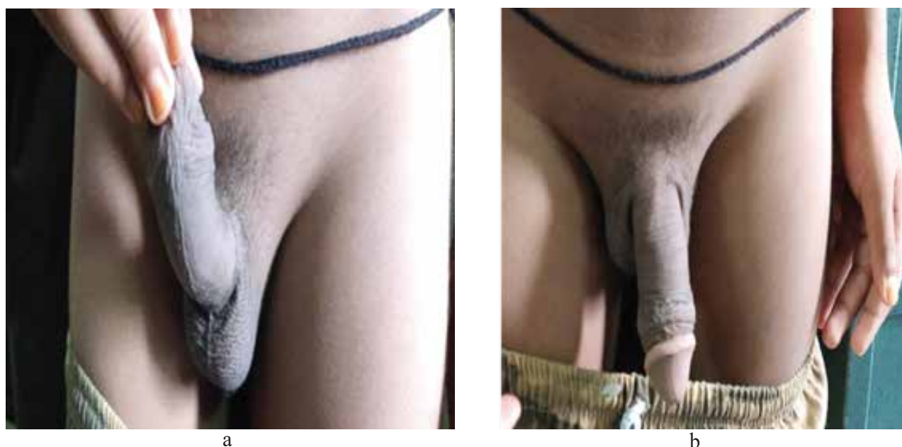
Figure 1 (a and b): Penile enlargement and pubic hair in the 4-year-old boy. In comparison, testicular volume was normal