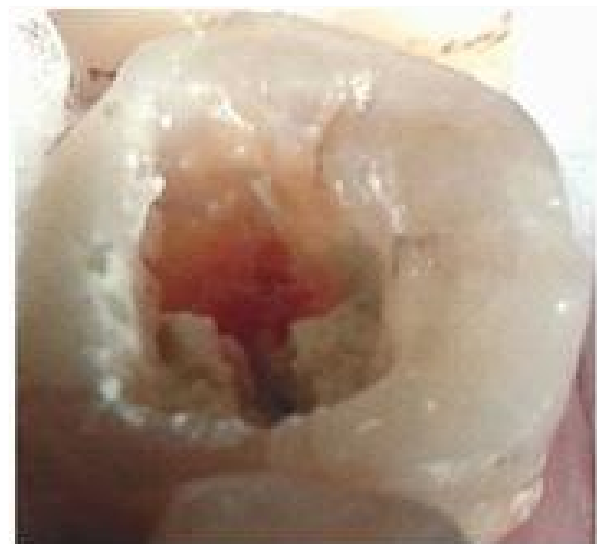
Fig-3: Repair of Perforation with MTA