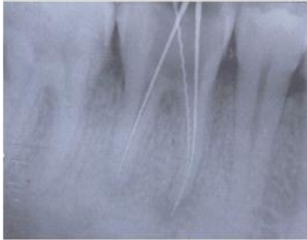
Fig-4: Working length determination