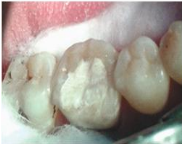
Fig-6: After placement of restoration