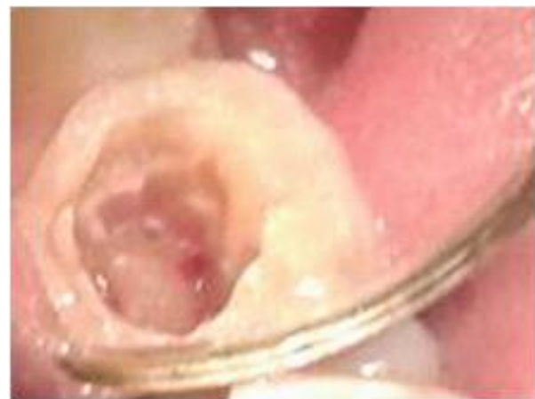
Fig-2: Site of Perforation