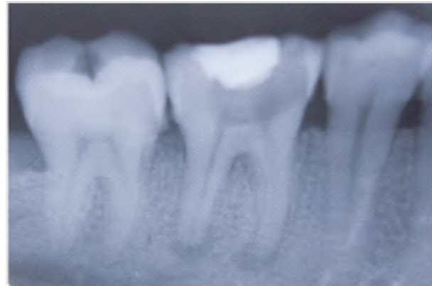
Fig-1: Initial X-Ray

The evaluation criteria for determining success following treatment of a perforated tooth include absence of symptoms, such as spontaneous pain or pain on palpation or percussion, absence of excessive mobility, absence of communication between the perforation and the gingival crevice, absence of fistula, absence of radiographic signs of demineralization of the bone adjacent to the perforation and the treated tooth must be functional 26,27 .