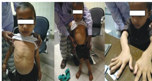
Fig 2: Classic features of rickets in a Bangladeshi child

Maternal vitamin D deficiency may cause overt bone disease from before birth and impairment of bone quality after birth 24,25 . Nutritional rickets exists in countries with intense year-round sunlight such as Nigeria and can occur without vitamin D deficiency. Vitamin D deficiency in children will cause growth retardation and classic signs and symptoms of rickets. In adult vitamin D deficiency produces osteomalacia due to defective bone mineralization and metabolism 26,27 .