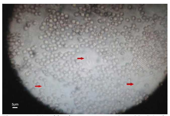
Figure 1: Wet blood examination (100 X) (Motile Trypanosoma evansi organism indicated by arrow).

0.05 or lower was considered to be significant and p -value lower than 0.01 considered as highly significant.