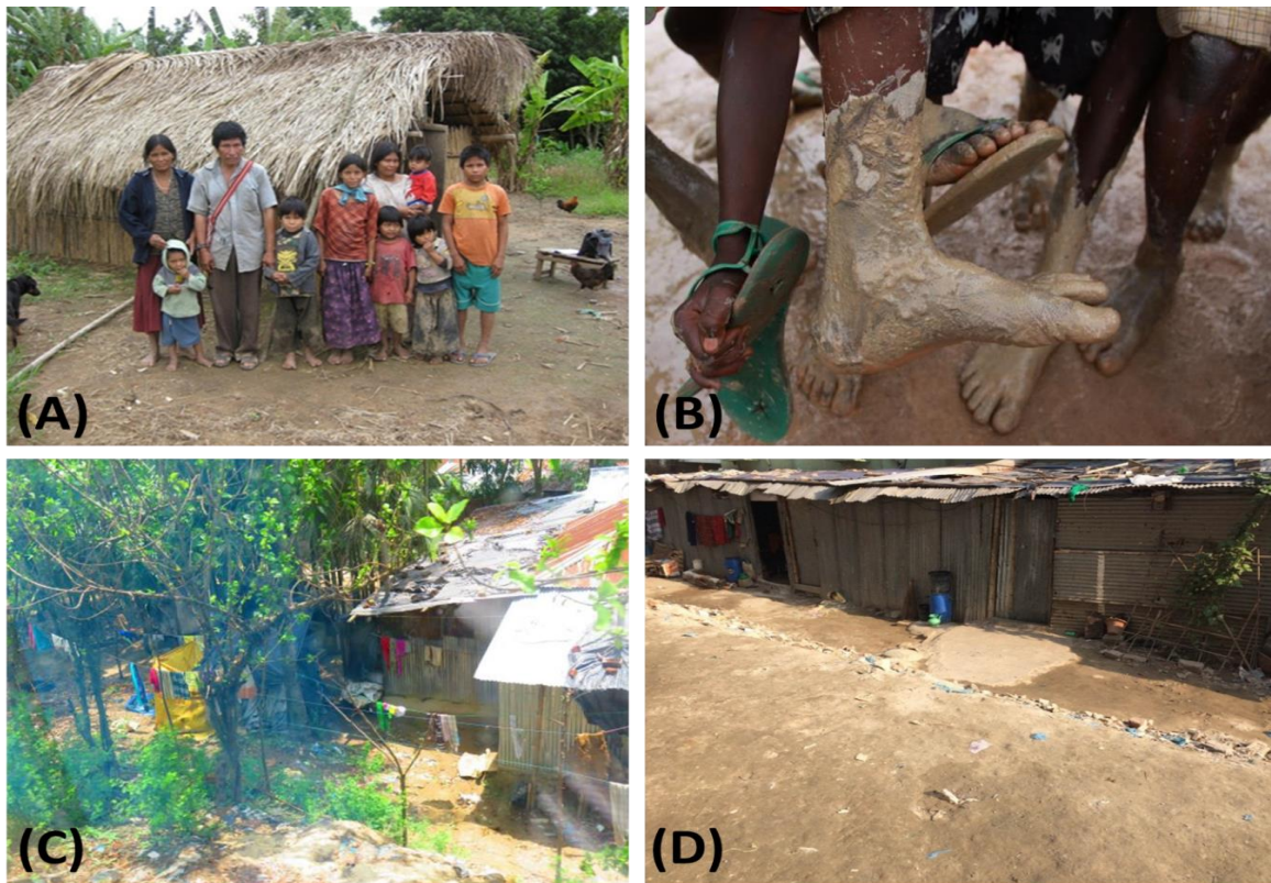
Figure 2: Socio-demographic status of rural communities (A-D)

during the rainy season, new infections again appear after 8-10 months (Schad et al., 1973).