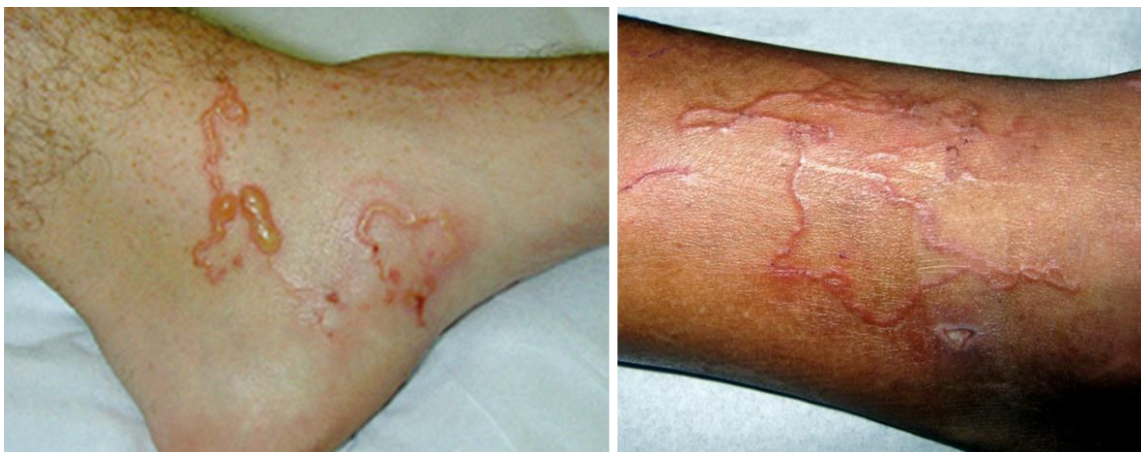
Figure 4: More exaggerated vesicular skin eruption by cutaneous hookworm larvae (Despommier et al., 2000)