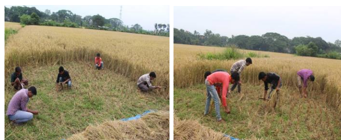
Fig. 5. Collection of dropped paddy and uncut stem