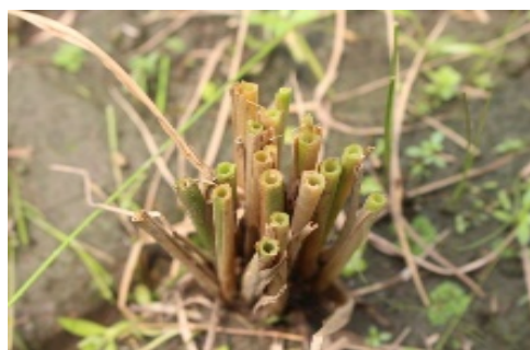
Fig. 6. Harvesting of paddy using 5.5" pulley