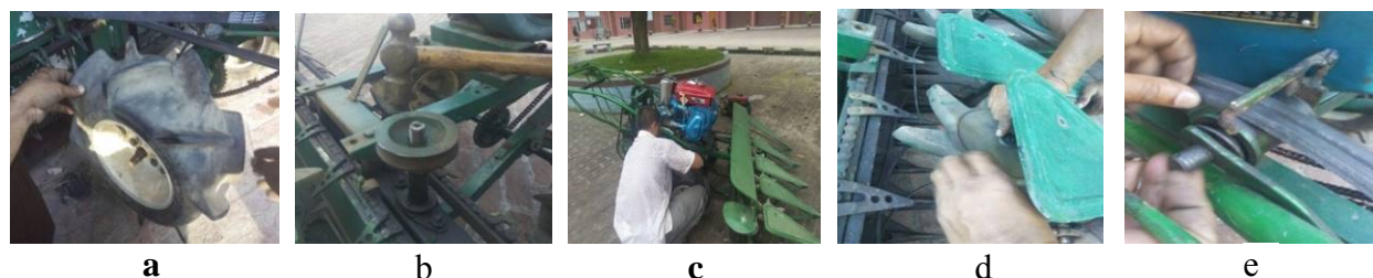
Fig. 2. a) Iron cage wheel replaced by tyre wheel, b) cutter bar pulley changed, c) old engine was replaced by new one, d) star wheel adjustment in engineering workshop, and e) belt and pulley setting adjustment

incorporated with belt power transmission system, which increased belt tension for proper power transmission. Star wheels and springs were adjusted after dismantling those parts for proper rotation and transferring of straw during harvesting. Vertical power transmission shaft was welded and adjusted with dog sprocket. Several sections of the reaper were dismantled and adjusted for balancing the weight of the reaper. Some modification activities before Boro/2017 paddy harvesting are shown in Fig. 2.