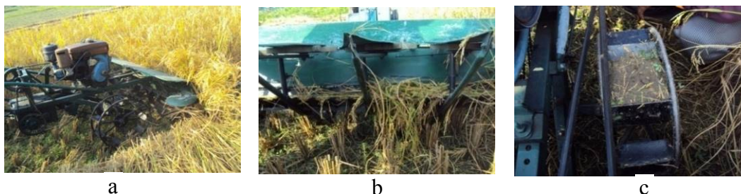
Fig. 1. Photographic views of Aman/2016 harvesting: a) using existing BAU self-propelled reaper b) straw clogged with cutter bar and chain, c) iron cage wheel of reaper

In Aman/2016, the existing BAU self-propelled reaper was tested to harvest paddy at BAU farm after long time (about 10 years) idle conditions of the reaper. During idle period, the reaper was not used due to several functional problems like (i) weight unbalanced, (ii) straw clogging with cutter bar and chain, (iii) improper adjustment of belt and pulley, (iv) slipping problem due to cage wheels, (v) poor condition of the prime mover (diesel engine), (vi) improper adjustment of vertical power transmission shaft with dog sprocket, (vii) improper adjustment of star wheel and spring and (viii) lower cutter bar speed than that of forward speed. Some identified problems during Aman/2016 paddy harvesting are shown in Fig. 1.