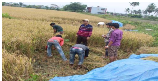
Fig. 4. Manual harvesting by sickle at BAU Farm

by manually using sickle as shown in Fig. 4. For cost calculation, required harvesting time and labor were counted and finally calculated based on the appropriate mathematical equations. For comparison of harvesting loss between manual and mechanical systems, two types of losses were measured, i.e. i) shatter and ii) cutter bar losses. Matured drop paddy from the panicle caused by bird, wind, rats, and handling operations were collected and measured. After completing the harvesting operation, uncut plant stems were also collected carefully and kept on the polythene sheet for estimating cutting loss as shown in Fig. 5.