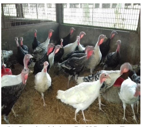
(b) Growing birds at BAU Poultry Farm