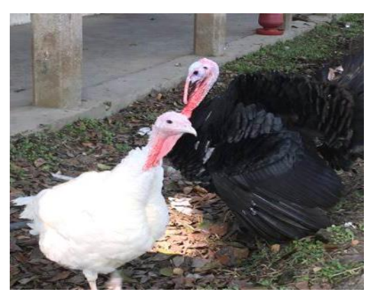
(c) Growing turkeys at 16 weeks of age