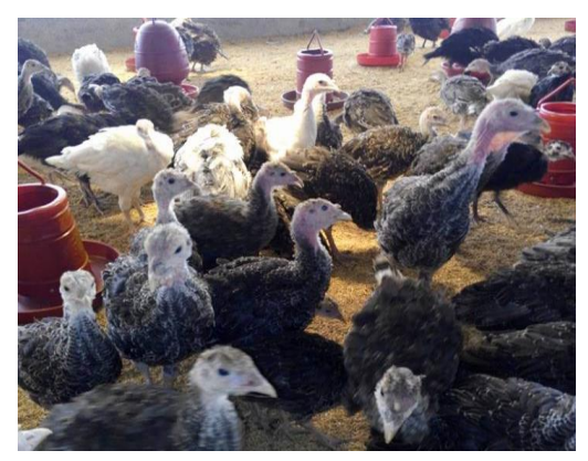
(a) Turkey poults at one month of age

by average body weight gain. The recorded data were analyzed using General Linear Model (GLM) procedures using one-way ANOVA through SPSS software. All data were analyzed for the completely randomized design. The significance differences were tested using Tukey's test.