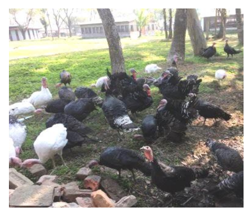
(d) Adult turkeys scavenging at BAU Poultry Farm

Photo: Experimental turkey birds at different ages rearing at BAU Poultry Farm