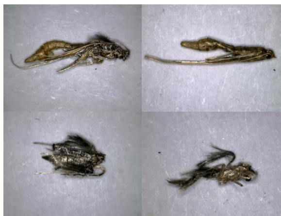
Fig. 1(A) Examples of unhatched pupae after the cocoon were removed (30x)

Means followed by the same letter at vertical rows shows no significant difference at p \geq 0.05