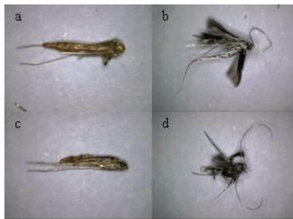
Fig. 1(B) Example of deformed adults a) abdomen, b) wings, c) antenna, and d) overall.