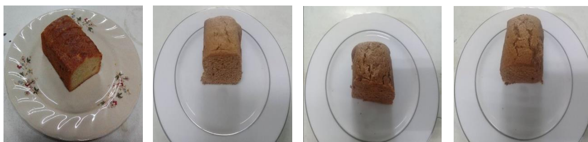
Fig. 2 Pictorial view of the processed cakes; Left to right: Sample A (100% WF); Sample B (90% WF and 10% JSP); Sample C (80% WF and 20% JSP) and Sample D (70% WF and 30% JSP)