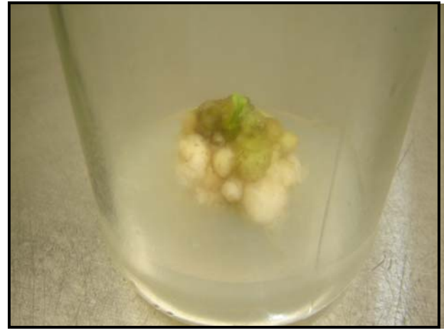
Plate 1. Photograph of proliferated calli of the variety Early Tropical in 3.0 mg L<sup>-1</sup> BAP + 0.1 mg L<sup>-1</sup> 2,4-D + 2.0 mg L<sup>-1</sup> AgNO<sub>3</sub>