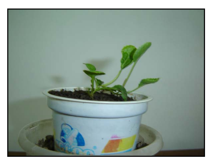
Plate 3. Regenerated plantlet of Tangail Special Pauslail in plastic pot kept in net house for hardening