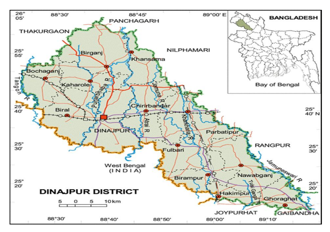
Figure 1. Map of Study Area

understanding of workforce dynamics and industryrelated socio-economic factors. A graphical representation of the study area is provided in Map 1.