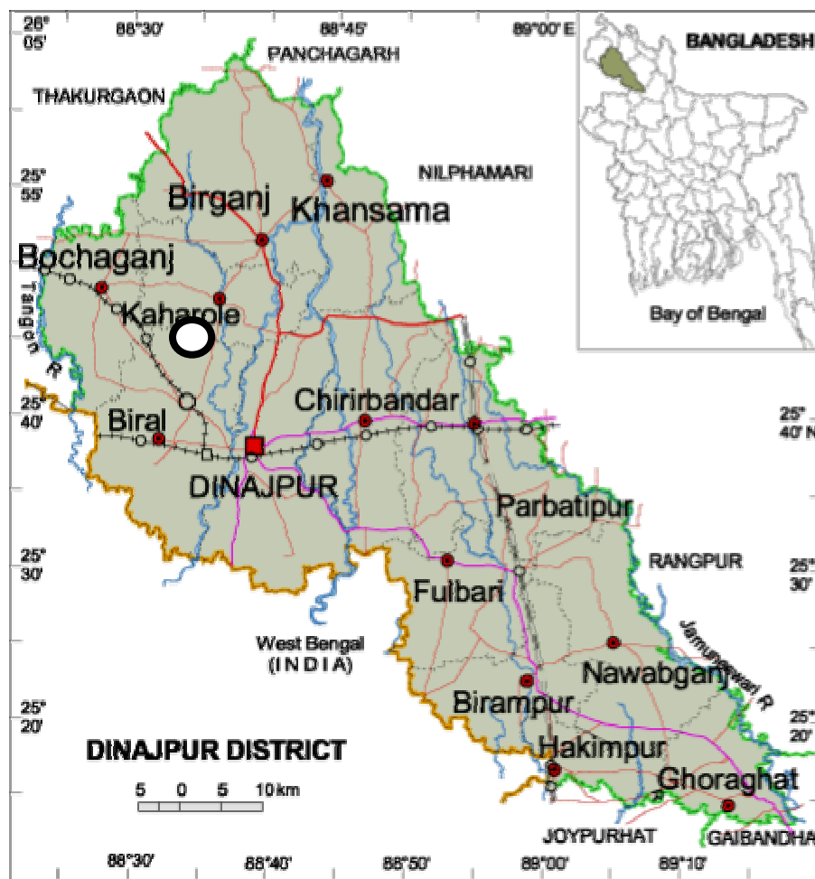
Fig. 1. Location of the study area (circled) in Kaharole, Dinajpur

The samples of Genetically Improved Farmed Tilapia strain (GIFT) ( Oreochromis niloticus ) for length-weight relationship determination were collected from the Tarala village of Kaharole upazila in Dinajpur (Fig. 1), Bangladesh which is one of the villages where WorldFish Center implemented their development project with adivasi households.