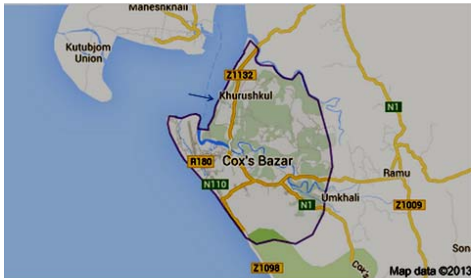
Fig. 1. Study area of the present investigation

The present investigation was carried out in the Institute of Marine Sciences and Fisheries, University of Chittagong and Khurushkul of Cox's Bazar district (Fig. 1). Desalination techniques are applied to water from a wide variety of sources. In addition to seawater, desalination can be applied to brackish water, river water, wastewater, and even treated water from municipal supplies. However, in this study only the application of seawater was investigated.