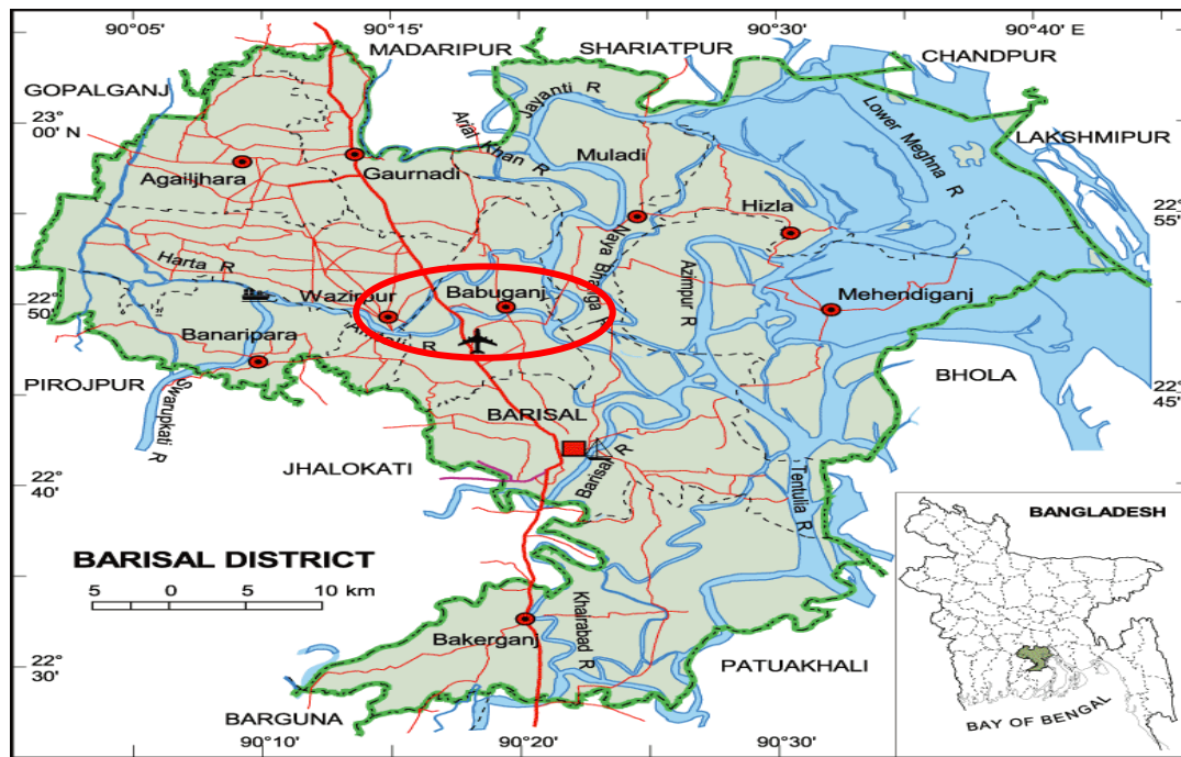
Fig. 1. The map of the study area (Modified from https://www.google.com.bd/search?q=barisal district map )