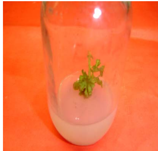
Plate 2. Shoot regeneration from callus of the genotype O-9897 on MS + 2.5 mg/L BAP + 0.5 mg/L IAA