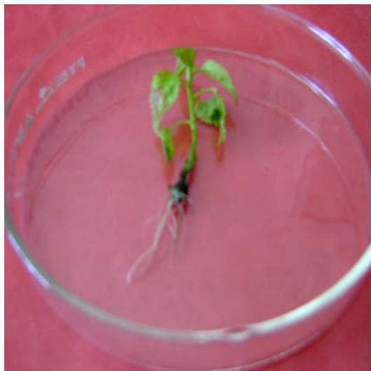
Plate 3. Initiation of roots from regenerated shoot of the genotype O-9897 on \frac{1}{2} MS + 0.6 mg/L IBA