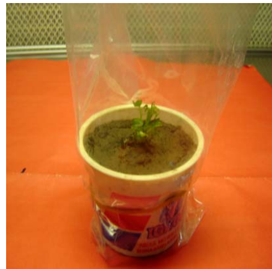
Plate 4. Transplanted regenerated plant of the genotype O-9897