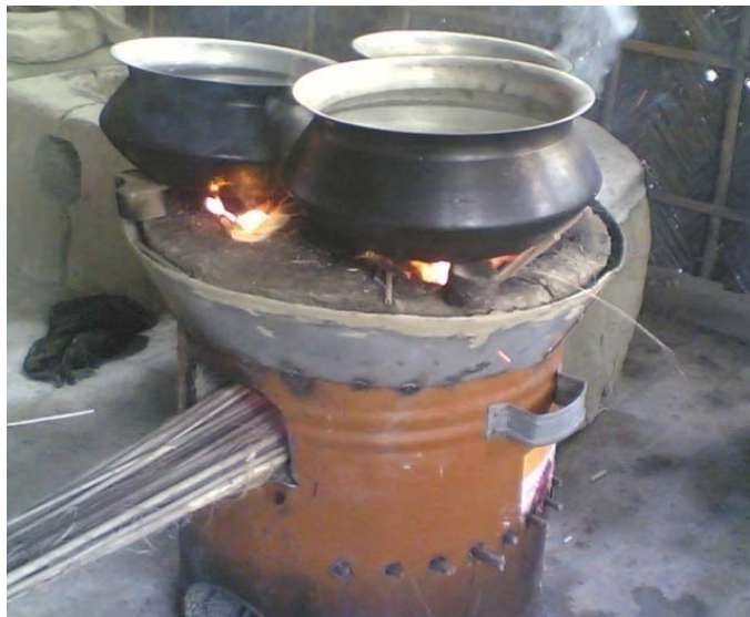
Figure.3 Photographic view of triangular triple mouth model Chula

Considering the results obtained from a series of trial Chula, a model Chula was constructed as shown in Figure 3. Iron drum of 38 cm diameter was used as enclosure of the earthen Chula having handle to move it easily. The upper part was enlarged sufficiently to hold 3 pots easily. It was provided with fuel inlet hole. The air entry facility was maintained by using stone making shape like traditional rural Chula. Exit opening hole was provided at the bottom. Steel bar baffle was provided at middle supports fuel wood at middle and ash deposited at bottom. However this model Chula can be modified for different types of pots, fire wood, volume of cooking etc.