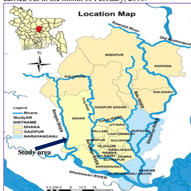
Fig. 1. Study areas of the Bangshi river in location map

Water sampling sites were concentrated at different locations of the Bangshi river at Savar upazila under Dhaka district of Bangladesh. The exact location of each sampling point was determined using GPS. Accordingly, the entire sampling sites were confined between 22°46'18.7" to 22°49'08.7"N latitude and 89°33'49.5" to 89°35'21.8"E longitude. The sampling locations have been identified using GPS. The detailed water sampling sites have been illustrated in Fig. 1. This sampling was carried out in the month of February, 2018.