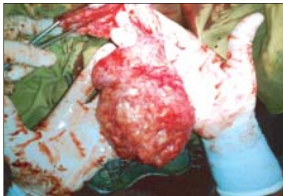
Fig.-2: Mass during dissection