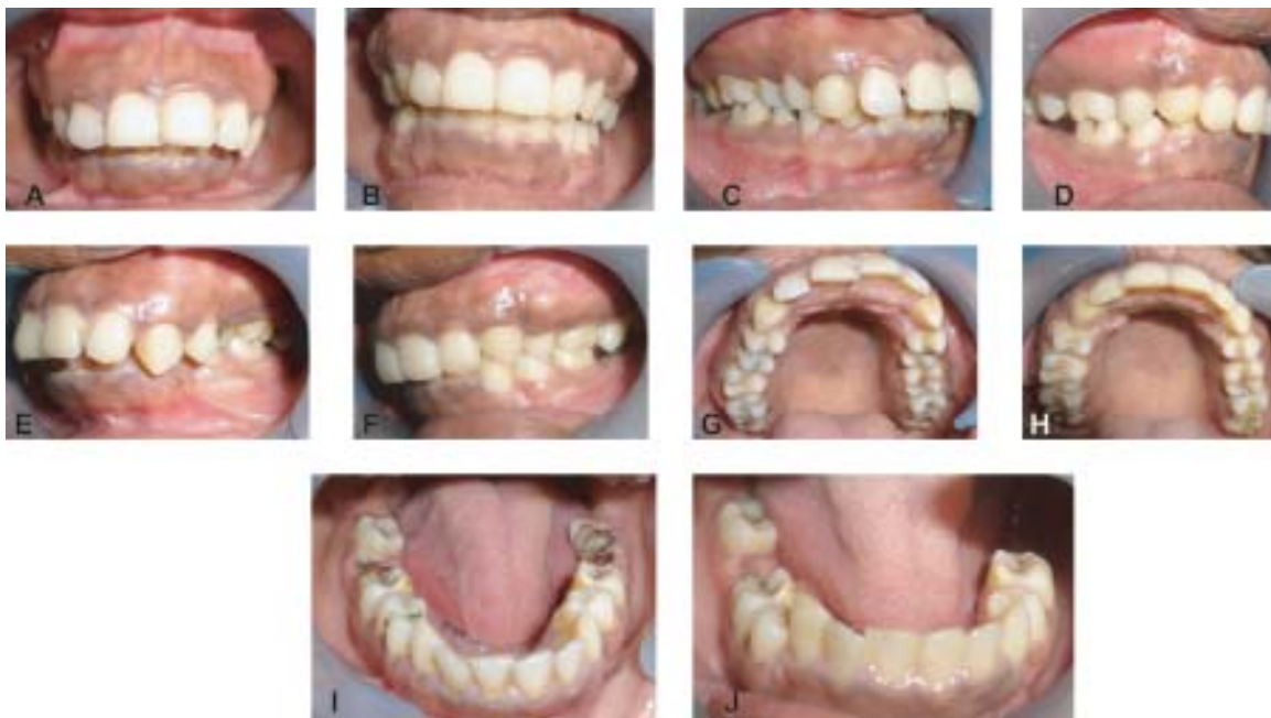
Fig-2: Patients intra oral photograph shows pre treatment front view (A), right lateral view(C), left lateral view(E), upper occlusal view(G),lower occlusal view (I) and post treatment front view (B), right lateral view(D), left lateral view(F), upper occlusal view(H),lower occlusal view (J).

exposure of upper teeth and gingiva noticed in resting condition. Smile analysis shows excessive exposure of upper and lower gingiva and teeth, beyond the lower border of upper lip and upper border of the lower lip causing the distortion of smile arc which ultimately resulting ill facial appearance during smiling and laughing (Figure 1 A,B). Intra-oral examinations reveal carious both upper second molar teeth, badly broken lower left second molar(37), third molar(38) and right second molar(47) teeth (Figure 2 A,C,F,G,I) with