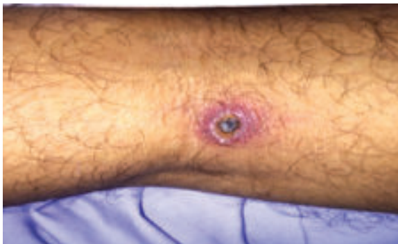
Fig-1: Eschar in popliteal fossa of patient

On the 5 th day of admission, the patient suddenly develop hypotension not responding to IV fluid challenge and on re-examination of patient there was found to have eschar in right popliteal fossa but no regional lymphadenopathy along with 105^\circ\text{F} and 70/50\text{ mmhg} - blood pressure. Blood culture revealed no growth. Widal titres were not rising. 2 nd sample of Weil-Felix titres were: OX2=1:80, OX19=1:80, and OXK=1:640. His hematological report revealed high level of pro calcitonin, raised D- Dimer, FDP and low fibrinogen level. So, patient was diagnosed as a case of septic shock with disseminated intravascular coagulation (DIC) due to scrub typhus and treated with cap doxycycline 100 mg 12 hourly and other supportive therapy. After getting 4 dose of doxycycline patient became afebrile, clinically improved and all lab reports came within normal range.