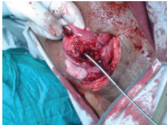
Fig.-4: Opening in Uterus