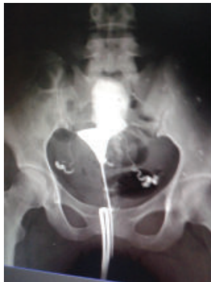
Fig.-2: HSG showing dye outside uterus