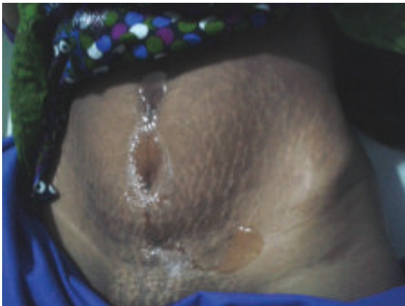
Fig.-3: After HSG