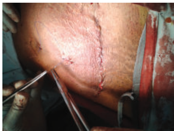
Fig.-8: After reconstruction