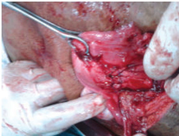
Fig.-5: After closure of uterus