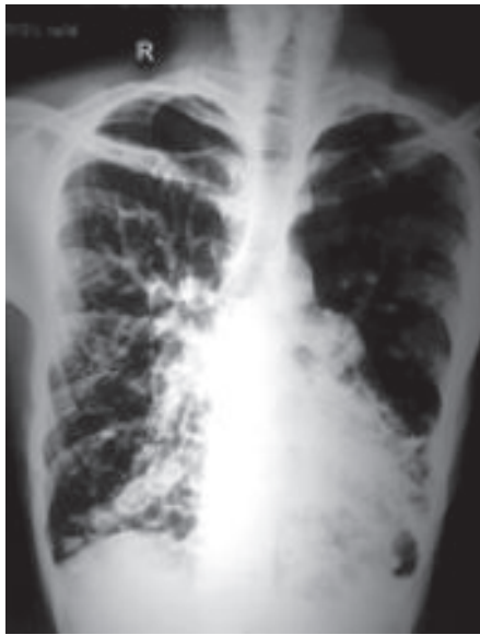
Fig-3: CXR P/A view- bilateral extensive cystic bronchiectasis.