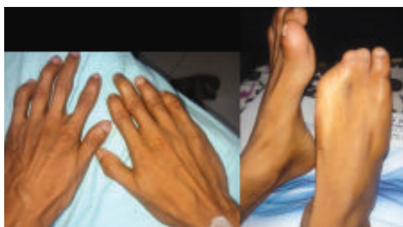
Fig.-2: Photographs of patient's deformed right hand & foot.

Examination of respiratory system revealed presence of bilateral coarse crepitations. Cardiovascular system examination revealed forceful apex beat in left 5 th intercostal space, loud pulmonary component of second heart sound & presence of faint systolic murmur in tricuspid and mitral area. Alimentary system & nervous system examination revealed normal findings including normal intelligence.