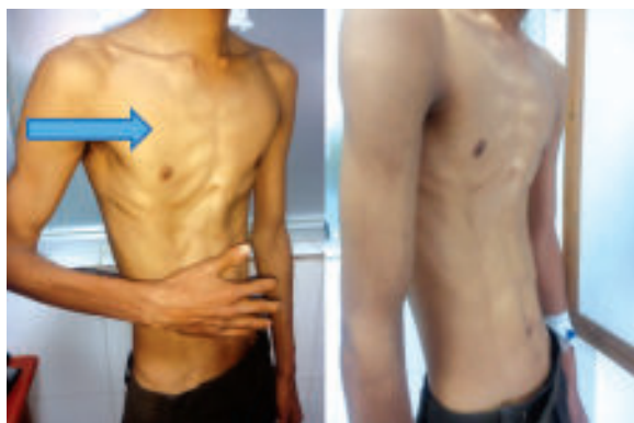
Fig-1: Flattening of anterior chest wall of right side.

Examination revealed, his chest was asymmetric with flattening of anterior chest wall of right side. The pectoralis major muscle was absent. (Fig- 01) The movements of right shoulder were possible. The fingers of right hand were short and webbed (sybrachydactyly) .He had deformed right foot also with only 3 fused fingers (Fig-02). The left side of his body had normal configuration.