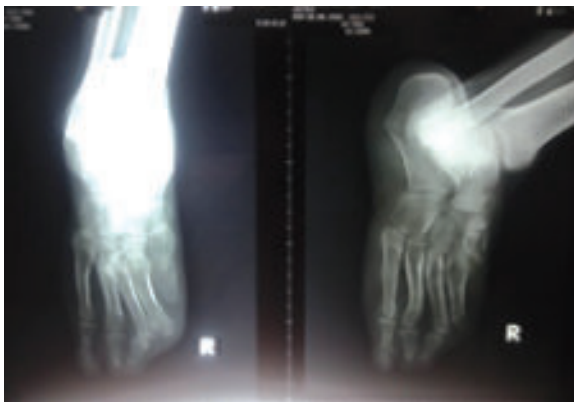
Fig-05: X-ray right foot

On the basis of physical findings & radiological evidence- a diagnosis of Poland syndrome was made. Along with this congenital anomaly, the patient had bilateral bronchiectasis with secondary infection with mitral valve prolapse & pulmonary hypertension. He was treated conservatively & his respiratory symptoms were improved. No surgical treatment was offered.