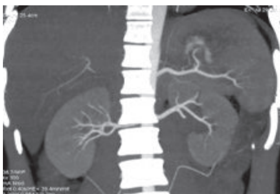
Fig.4: Active bleeding from left gastric artery.