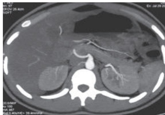
Fig. 3 : Active bleeding from short gastric artery branch from splenic artery.