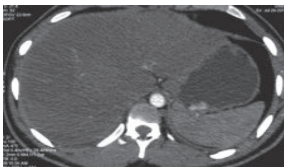
Fig.1 : High density area along fundus of stomach.

After intravenous contrast administration, early arterial phase i.e. CT angiogram (18 sec after giving I/V contrast) scan was taken to see Aorta and its branches to identify bleeding vessels. Two active bleeding vessels were identified. One from short gastric artery branch of splenic artery supply the fundus (Fig. 1 and 3) and another from left gastric artery supply the lesser curvature of stomach (Fig. 2 and 4). No aneurysm was identified.