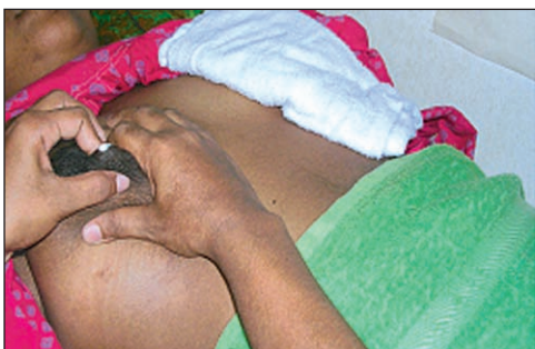
Manipulation-8D Manipulation 8(A-D)