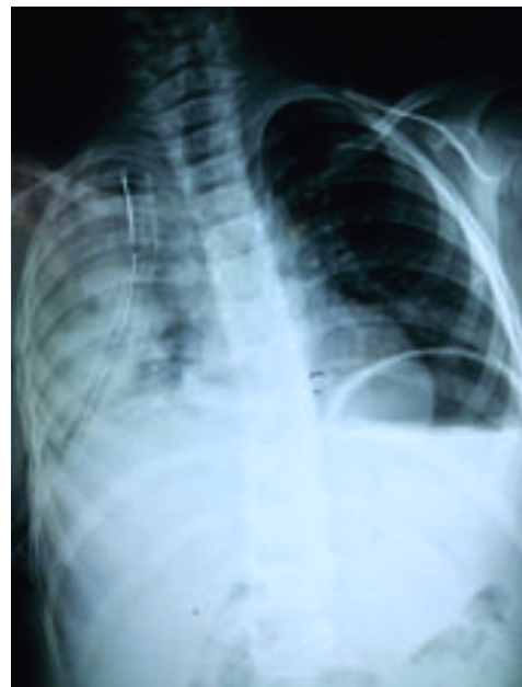
Fig.-2: Xray chest showing drain in situ & Rt lung opacity

T again presented in May 2015 with the complaints of fever and cough along with respiratory distress. Investigations were done including serial CXR's (Fig 2, 3), USG and CT scan of chest (Fig 4) which showed ‘Encysted mild Hydro-pneumothorax with mild pleural