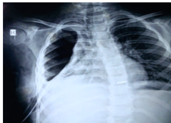
Fig.-3: X ray chest showing compression collapse