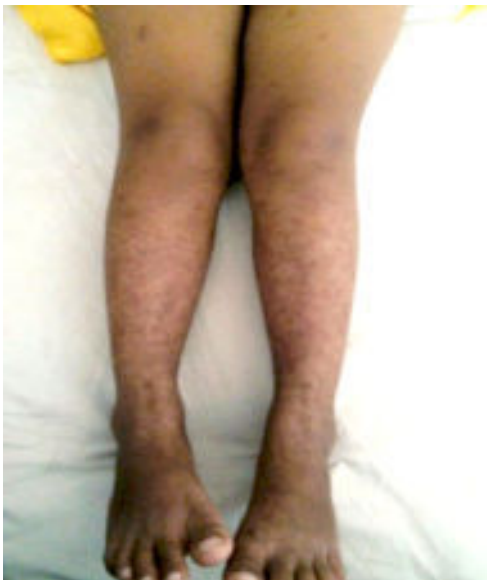
Fig.-1: Showing a diffuse polymorphic rash over Limbs

In 2014 ‘T’ at her six year of age presented with rash over her legs that were initially maculopapular in nature however it later turned into petechial, purpuric and somewhat urticarial. (Fig 1) Besides she had arthritis involving multiple large and small joints of both upper and lower limbs including both ankles, both knees and small joints of hands and feet. Joints were swollen, tender and some sorts of limitation were observed at the affected joints. Along with routine investigations skin biopsy was done and report suggested ‘Isolated