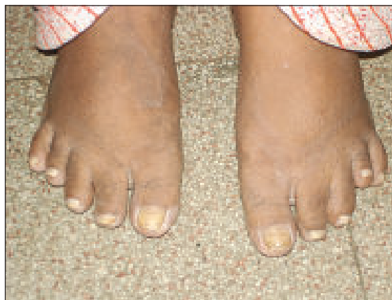
Fig.-2: Showing short left 4 th toe, onychomycosis, hyperpigmented & hyperkeratotic lesion over the dorsum of the foot.

Chvostek's and Trousseau's signs were positive. She had papilloedema in the left eye and cataract in the right eye. The hands and feet were stubby and her left 4th toe was found short (Fig-2).