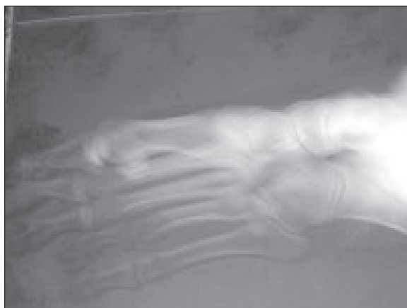
Fig.- 3: X-ray left foot showing short 4th metatarsal