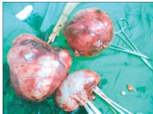
Fig.-4: Two removed lump with left kidney