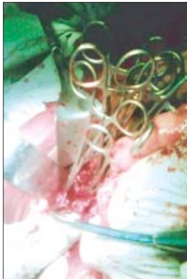
Fig. 2 Application of series of artery forceps

Surgical procedure: Under GA, the abdomen was explored through long midline incision, after packing of the small intestine into right side of the abdomen the bigger lump was exposed. Prominent blood vessels were observed on the surface of the lump (Fig. 1). Entrance into the retroperitoneal space was made after stripping off the peritoneum. Finger dissection was used to separate the large vessels from the lump and divided, ligated between the artery forceps. During separation of the lump from the posterior aspect, it was found tightly adherent to the left renal hilum.