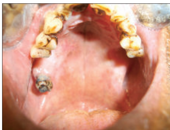
Fig.-6: Post treatment showing complete resolution of palatal lesion (Case-2)

With proper education and counseling, patient was treated with oral Itraconazole 200 mg twice daily. The lesions completely healed following four weeks medication (Figure 6). The patient, however, is under