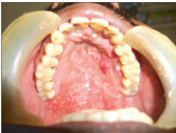
Fig.-1: Ulcer present on the palatal mucosa and gingiva (Case-1)

Extraoral examination revealed imaciated face with mild anaemia and enlarged, firm, non-tender, non-fixed lymph nodes in bilateral submandibular regions. Intraoral examination revealed widespread ulcer in marginal, interdental and attached gingivae, muosa of whole hard palate and also labio buccal gingiva of left maxilla. Granular white patches were evident to the soft palatal mucosa. The ulcers were tender with edematous, raised margin, granular surfaced and easily bled on touch. The surfaces were covered with slough and focal areas of necrosis (Figure 1).