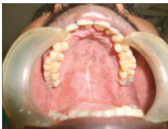
Fig.-3: Post treatment showing complete resolution of palatal lesion (Case-1)