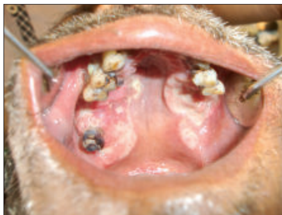
Fig.-4: Ulcer present on the palatal mucosa and gingiva (Case-2).

Haematological values were within normal limits with normal blood sugar level and non-reactive VDRL, HIV1 and HIV2 in Western blot assay. Related investigations were done to exclude dissemination of the disease. Orthopantomogram showed no significant alveolar bone loss. Considering the possibilities of deep fungal infection, tuberculosis or mucosal malignancies, incision biopsy was done. Initial biopsy report revealed severely inflamed and oedematous fibrocollagenous tissue covered by ulcerated stratified squamous epithelium showing minor salivary glands with multiple granulomata composed of epitheloid cells with extensive areas of caseation necrosis which was consistent with tuberculosis. The patient was re-evaluated by a group of physicians who recommended repeat biopsy which revealed dense infiltration of acute and chronic inflammatory cells including many eosinophils, aggregates of epitheloid histiocytes and some of the histiocytes contained intra-cytoplasmic round to oval bodies; morphologically consistent with histoplasmosis. There was no evidence of caseous necrosis or malignancy in the tissue sections (Figure 5). Based on the clinical features and investigatory findings, a final diagnosis of oral histoplasmosis in a non-HIV patient was made. Then the patient was evaluated systemically, where systemic involvement of histoplasmosis was ruled out.