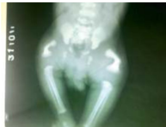
Fig.-4: X-ray showing femoral hypoplasia with dysplastic pelvis.

X-ray of both lower limbs including the hip revealed bilateral femoral hypoplasia with dysplastic pelvis (Fig-4). X-ray of upper limbs showed no bony abnormality. Echocardiography revealed no cardiac anomaly and USG of genito-urinary system was normal. With these above mentioned clinical and radiological findings, the baby was diagnosed as a case of FH-UFS.