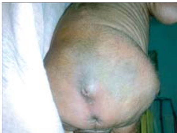
Fig.-3: Spina bifida

Tongue tie was also present. Upper limbs showed flexion deformity of both elbow with skin dimpling. Both thighs looked laterally rotated. Length of the thighs was very short compared to leg length, knee joint being rudimentary. There was spina bifida at the sacral region (Fig-3).