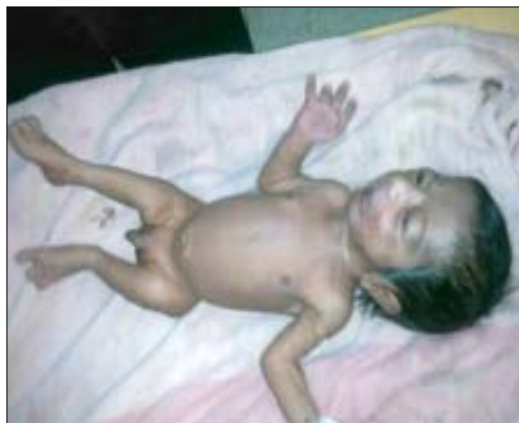
Fig.-1: Craniofacial dysmorphism