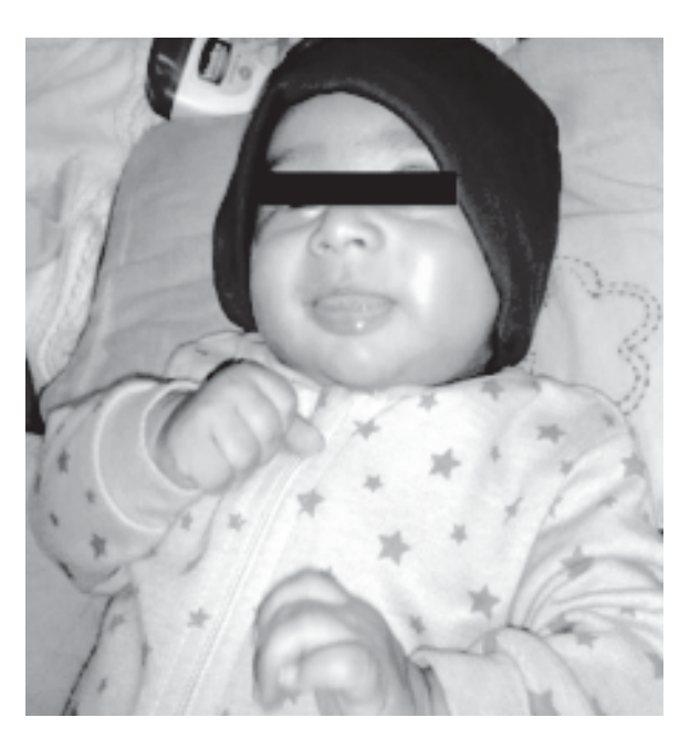
Fig.-2: The newborn infant with laryngeal hamartoma after recovery

Consequently, the baby was maintained on enteral feeds with plans for clinical re-evaluation. At a 2 month follow-up visit, the patient demonstrated no respiratory complaints or flexible fiberoptic laryngoscopy findings of recurrence. She is now 9 months old and doing well without any respiratory symptoms or feeding difficulties (Fig.-2).