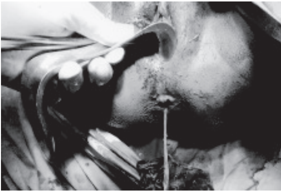
Fig-1: The umbilical cord was hanging per rectum & anus from where placenta was delivered first.

in rectum which was driven down through the large fistula to the capacious colon to rectum & was brought out per rectum by an assistant. The big hole of the uterus was then closed with vicryl 1 in two layers. Colostomy was done at the level of sigmoid fistula by Hartman's procedure. Peritoneal toileting was done & a drain tube was placed in pelvic cavity. Abdomen was closed in layers. Patient was put on broad spectrum antibiotics & nothing per oral for seven days. Total six units blood was transfused. The post-operative period was uneventful except the abdominal wound got infected & secondary suture was given on 3.8.2013. The patient was discharged after ten days & advised to come for follow up.