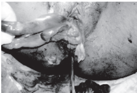
Fig-2: Aborted fetus delivered vaginally with breech presentation & the umbilical cord was hanging from anus.