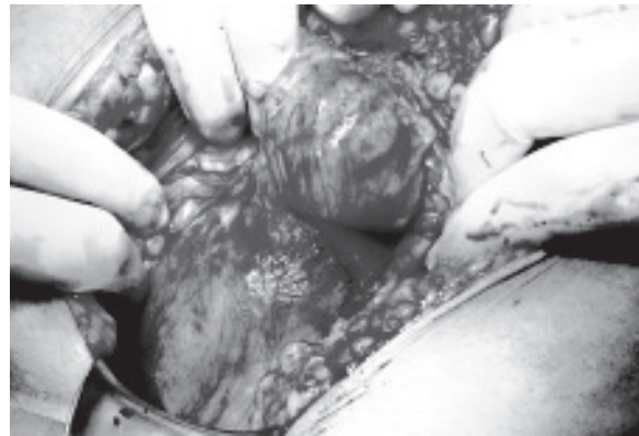
Fig-3: Laparotomy shows fistula in between the uterus & sigmoid colon.