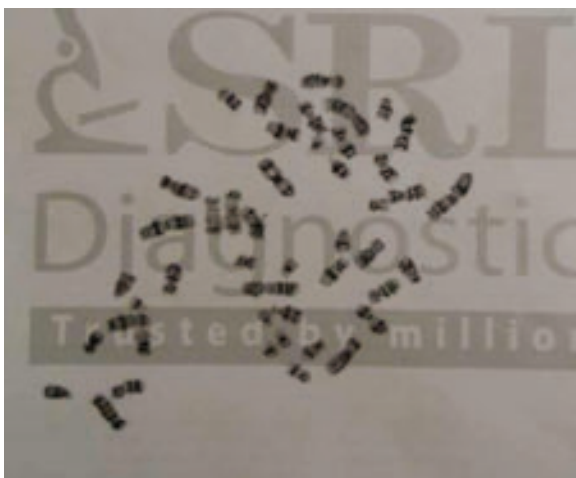
Fig.-2: Karyogram (case 2)

Her peripheral blood karyotype was done on 24.12.13 revealed normal karyotype (46 XX) which eliminated any possibility of mosaicisms. (Picture attached)