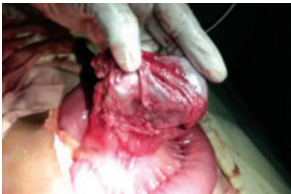
Fig.-3: After aspiration