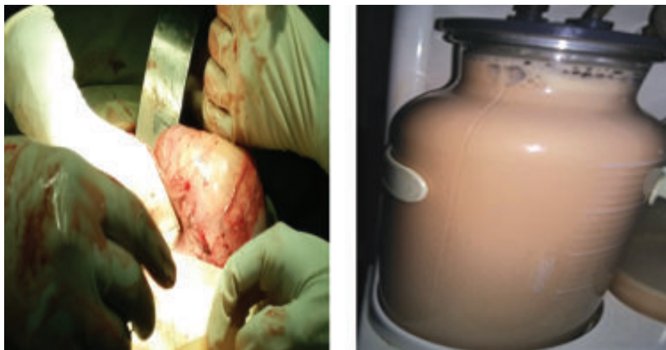
(a) (b) Fig.-2: (a) Intra operative cyst identification, (b) The cyst contained