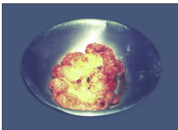
Fig.-1: Resected portion of jejunum with pneumatic cysts.

About 2 feet of the involved portion of proximal jejunum was resected and continuity restored with end to end anastomosis. The cysts on the resected portion of gut were not communicating with the intestinal lumen and with each other. A drainage tube was placed at the site of anastomosis and wound closed in layers after proper haemostasis. The drainage tube was removed on 3 rd post-operative day. The patient was allowed to eat and drink, starting on 4 th post-operative day, with liquid diet and gradually semi-solid and finally with solid food. There was neither vomiting nor abdominal distension. The wound healed normally and skin sutures were removed on 8 th post-operative day and the patient was discharged from the clinic on 10 th post-operative day.