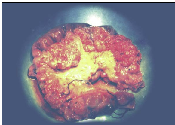
Fig.-2: Resected portion of jejunum with pneumatic cysts.