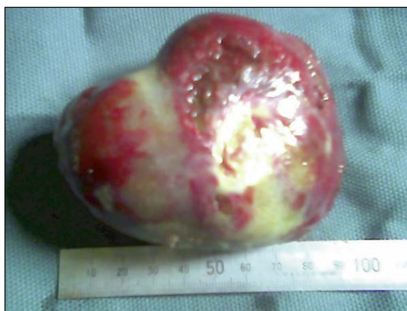
Fig.-3: Histopathology was consistent with myxoma.

Finally, he was feeling well, all parameters were within normal limit and the neurological and constitutional symptoms disappeared.