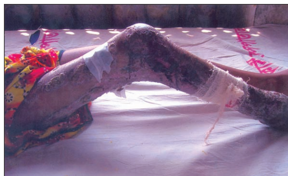
Fig.-3: Lesion of the foot before treatment with anti TB drugs.