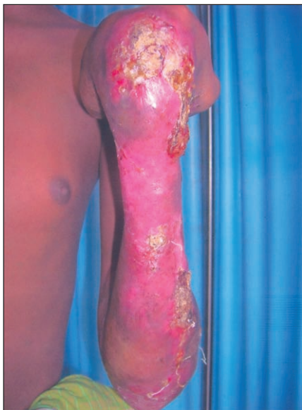
Fig.-4: Lesion of the hand after 3 months treatment with anti TB drugs.