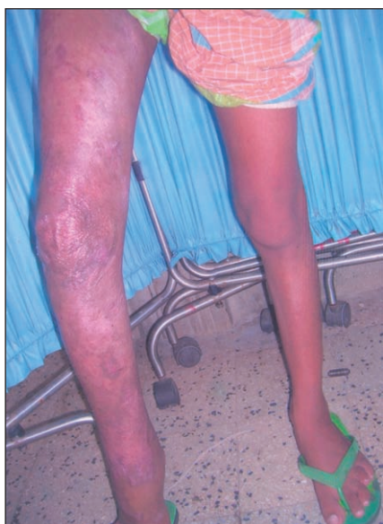
Fig.-5: Lesion of the foot after 3 month treatment with anti TB drugs.

regimen this patient will receive some form of reconstructive surgery to relieve his wound contracture.