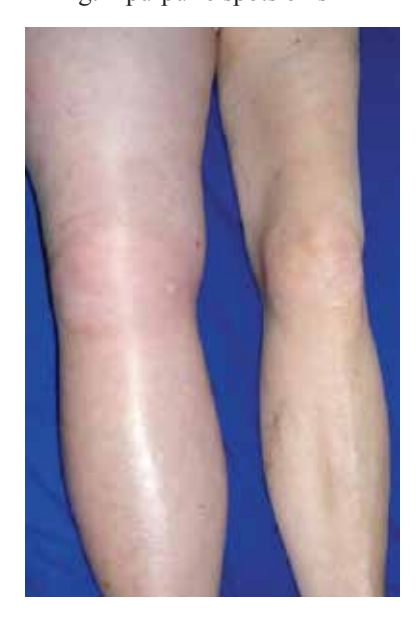
Fig: 2 DVT of right leg

A 21-year-old lady, presented to the emergency with the complains of reddish spots all over the body (Fig: 1), specially on neck and extremities of multiple size